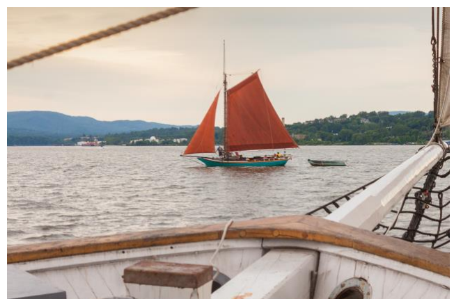
Friday Night Crew Training

NEXT EXEC. COM. MEETING Tuesday, June 23, 6:00 p.m.