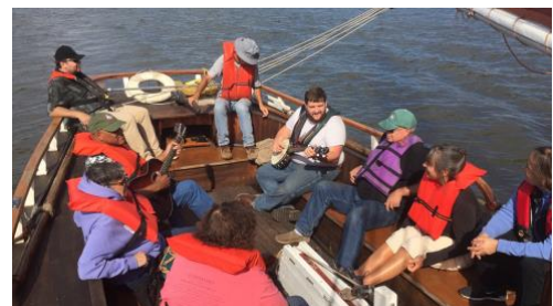
Sloop Club Congress Sail, 2018