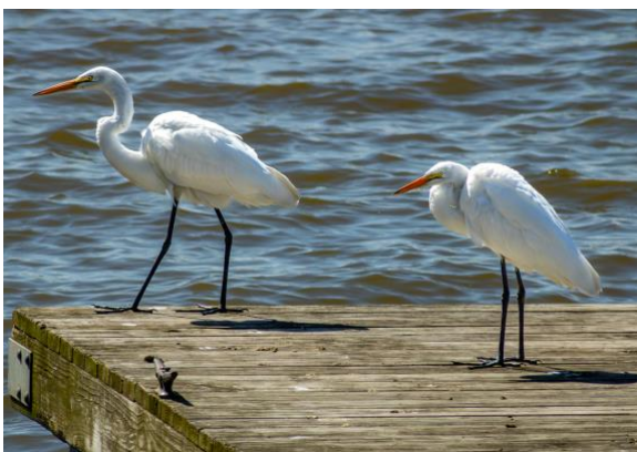
Visitors to the Corn Festival

Clearwater's Annual Meeting Sun., Oct. 1 University Settlement Camp 10 am